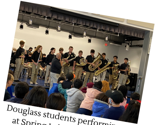
Douglass students performing at Spring Lake Elementary