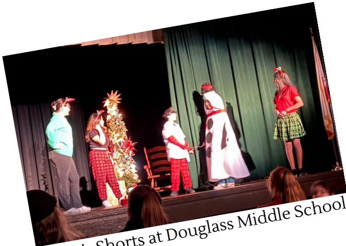
Santa's Shorts at Douglass Middle School