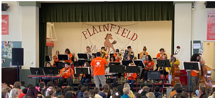
Woodland High students performing at Plainfield Elementary